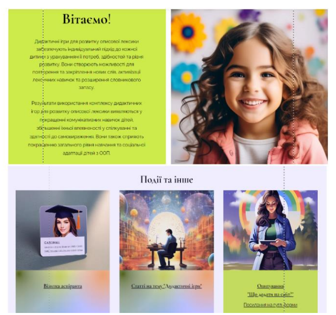
Figure 2. Home page of the website with didactic games