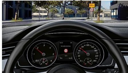
Fig. 4. An example of Volkswagen Sign Assist

Volkswagen Sign Assist is a technology system used in Volkswagen vehicles to recognise road signs and display information about them on the dashboard [4]. This system helps drivers to be more aware of the road environment and to comply with traffic regulations.