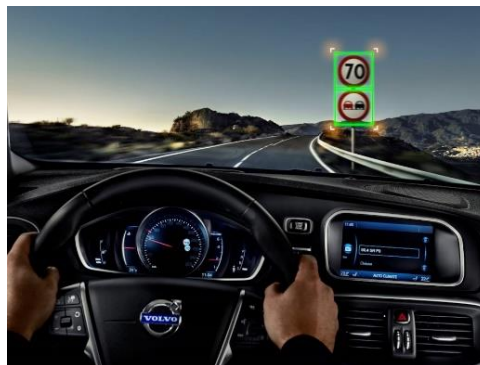
Fig. 3. An example of RSI operation

Volvo offers road sign information (RSI) safety features in many of its vehicles. It uses cameras and sensors to recognise road signs and provides drivers with real-time information about the road signs they encounter [3]. This system helps to increase driver awareness and compliance with traffic rules.