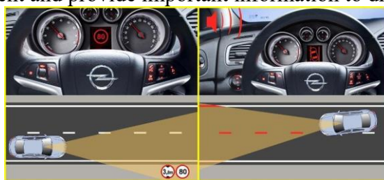
Fig. 1. Example of Opel Eye operation

The Opel Eye system is an innovative technology used in Opel cars (Vauxhall in the UK) to improve safety and help drivers while driving [1]. It includes a variety of functions and sensors to monitor the road environment and provide important information to drivers.