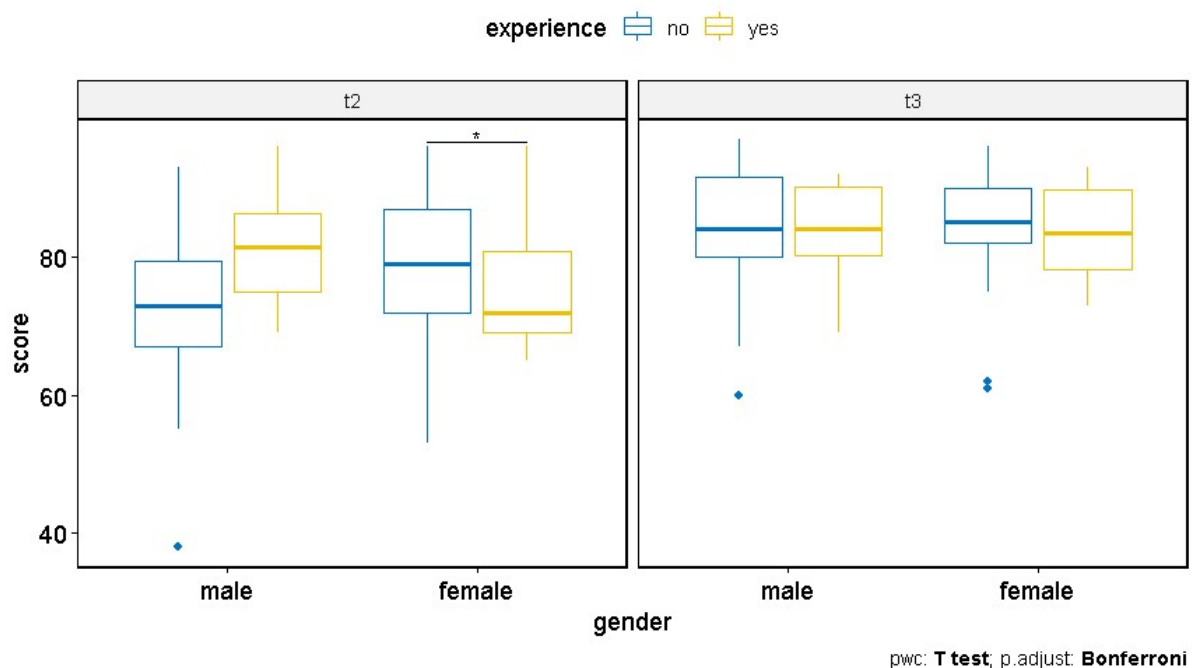
Figure 3: The box plots of summary statistics.

Anova, F(1,50) = 7.25 , p = 0.01 , \eta_g^2 = 0.02