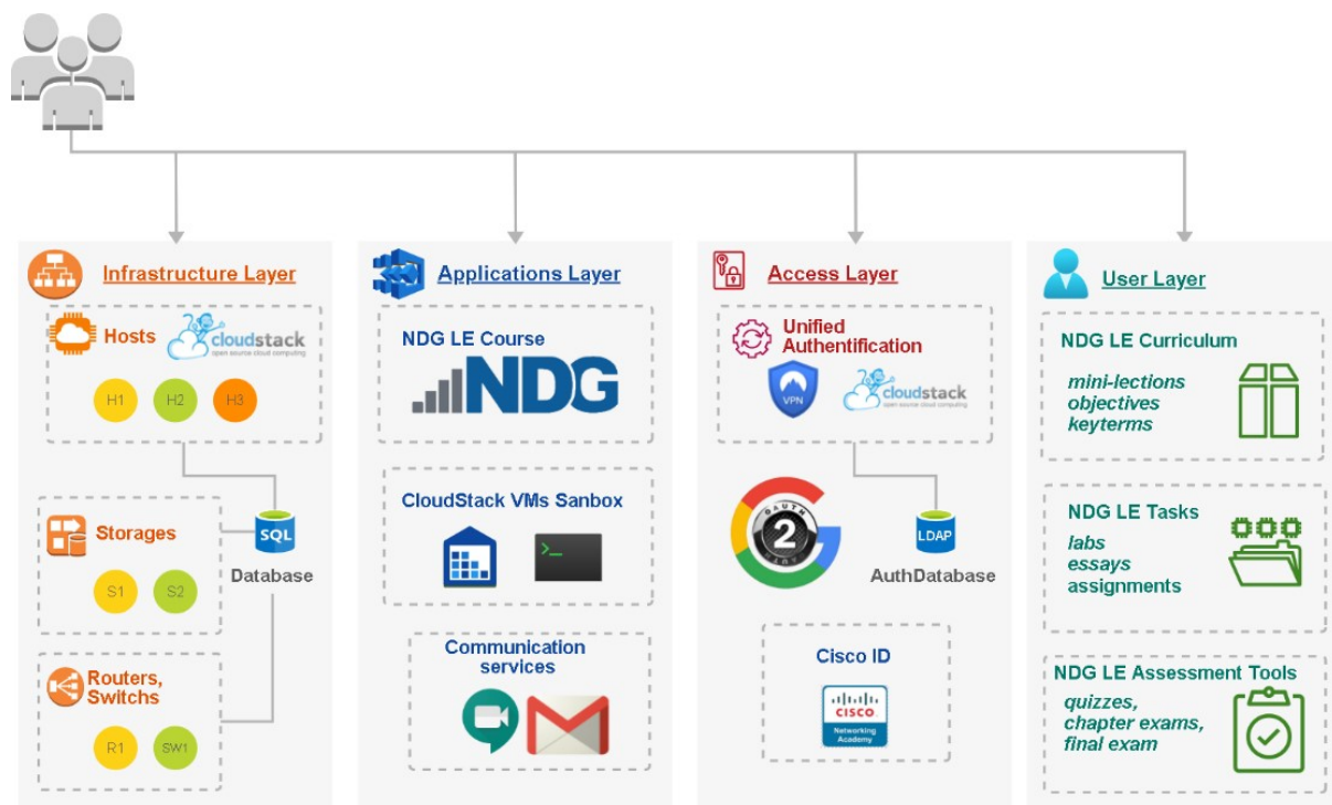
Figure 1: The architecture of the laboratory CL-OS

The CL-OS laboratory model is presented as a 4-layer structure. Infrastructure, application, access, and user layers implement technical and educational requirements for the cloud laboratory. This laboratory corresponds to the cloud concept: it is fully automated, inexpensive and scalable in design; Apache Cloudstack or Proxmox VE cloud platforms architecture provides simultaneous work of students with Linux VM from 50 to 100 students [51]. The maximum number of VMs will be in the case of the command-line mode of VMs running. If students need to work with a graphical interface, the number of VM will be approximately 2 times less.