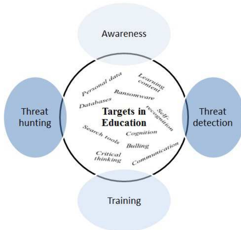
Fig. 3. The general model of cyber threats in the field of education and mitigating their impact

Special attention should be paid to the increasing role of mass-media and social networks in remote education with accompanying cybersecurity challenges.