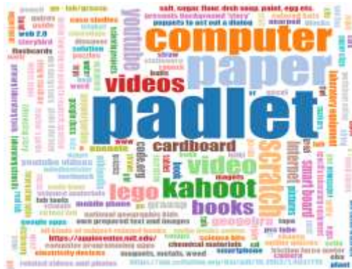
Fig. 1. The map of important tools that can help develop teachers’ creativity and use the STEAM-oriented learning environment in schools according to the answers.

We suggested that, by using the service Word Cloud ( https://www.mentimeter.com/ ), teachers choose five important tools that can help them develop their creativity and use the STEAM-oriented learning environment in schools (2019). A total of 1542 respondents answered the question “What information and communication technologies are needed to introduce STEAM education into the learning process in schools?” (Fig. 1).