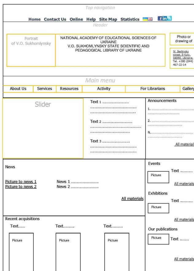
Fig. 1. Schematic representation of the interface of the SSPL web portal

The library's web portal is a collective product, the development of which at a substantial level involves practically all departments of the SSPL, while the technological support is carried out by the Sector of Information and Communication Technologies and Scientometrics of the Department of Scientific Information and Analytical Support of Education.