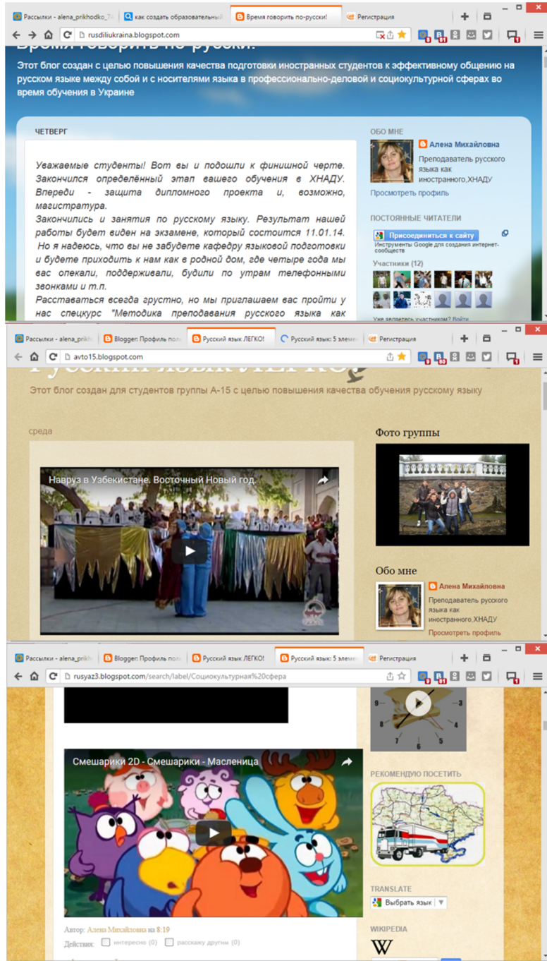
Fig. 1. Exemplary screenshots of educational blogs