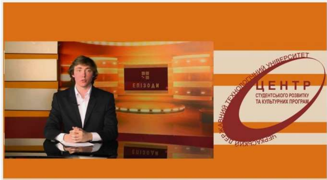
Fig. 1. Partial segment of virtual studio of CSTU

The review of the ability to record and montage video lectures with the help of Campatasia Studio [4] became the know-how of our courses. The virtual studio of CSTU (fig. 1) helped embody this project practically, so everyone could record all necessary information.