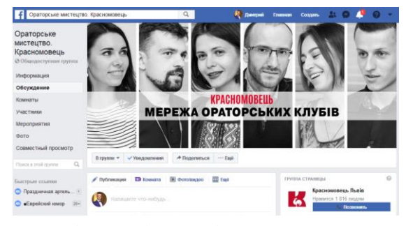
Figure 4. The community "Oratorske mystetstvo. Krasnomovets" in Facebook