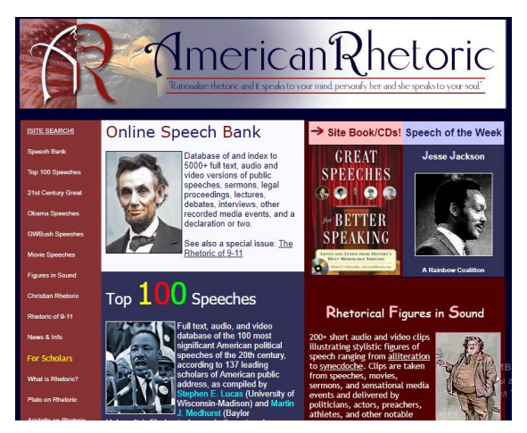
Figure 1. Resource American Rhetoric

• electronic educational resources on rhetoric: electronic texts, diagrams and tables, portraits, materials from multimedia encyclopedias, slides, soundtrack, video clips, etc. (Table 1).