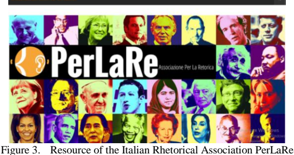
Figure 3. Resource of the Italian Rhetorical Association PerLaRe Associazione Per La Retorica