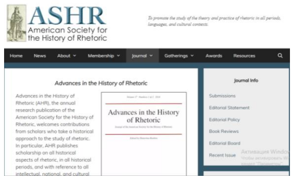
Figure 2. Resource American Society for History of Rhetoric