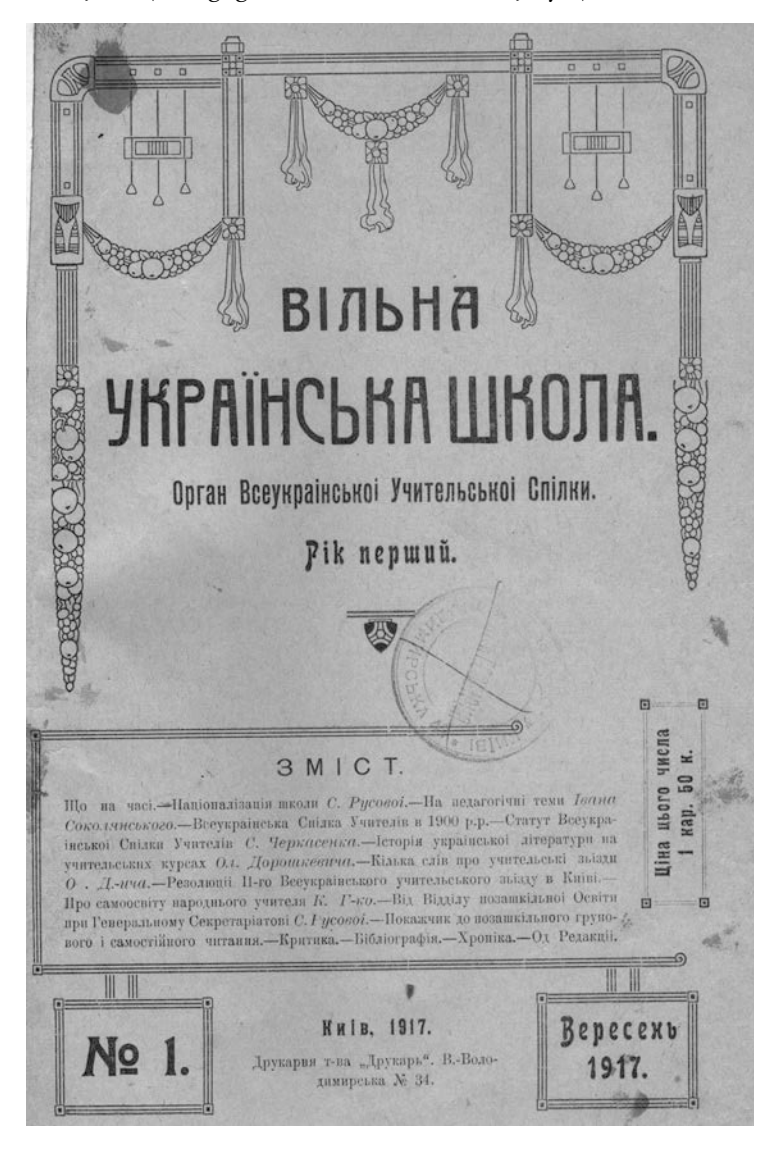
Pic. 2. The cover of the journal «Vilna Ukrainska Shkola», 1917, n. 1 (Pedagogical Museum of Ukraine, Kyiv)

«Vilna Ukrainska Shkola» [«Free Ukrainian School»] is an educational and public-political journal; the body of the All-Ukrainian Teachers' Union. It was published in Kyiv from November 1917 to June 1920; it was the follower of the pedagogical ideology of the journal «Svitlo». The activity of the Vilna Ukrainska Shkola was aimed at creating a national system of education in Ukraine and rebuilding it on the basis of European pedagogy. The journal was banned during the Soviet period.