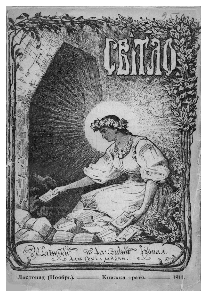
Pic. 1. The cover of the journal «Svitlo», 1911, n. 3 (Pedagogical Museum of Ukraine, Kyiv)

«Svitlo» [«Light»] was the first official Ukrainian pedagogical journal. It was published in Kyiv in 1910-1914 and played an important role in the consolidation of Ukrainian educators and public figures before the idea of a national school. It was a rostrum for discussing ways to develop national education, a platform for the formation of Ukrainian methodological science. The journal «Svitlo» presents the concept of the future of the Ukrainian national school, in particular, it tries to analyze the fundamental theoretical and methodological problems of its development, such as the definition of the goal, objectives, methods, forms, structure, etc.