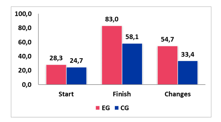
Figure 3: Dynamics of changes in the levels of development of information research competence of scientific and scientificpedagogical workers at the beginning and end of the pedagogical experiment between CG and EG (arithmetic mean of relative values of individual scores)

After analysis, we conclude that at the beginning of the pedagogical experiment of information research competence of researchers and pedagogical workers in CG and EG were below baseline, and at the end of the pedagogical experiment in CG the level of this competence increased to medium, and in EG to high level.