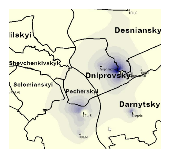
Fig. 1. Map of sulfur dioxide emissions distribution from the largest Kyiv's enterprises (2019)

Algorithms and software were developed to implement possible scenarios for monitoring data analysis from different sources, taking into account expert assessments of the tolerability of different levels of health risks for different categories of population based on the proposed approach.