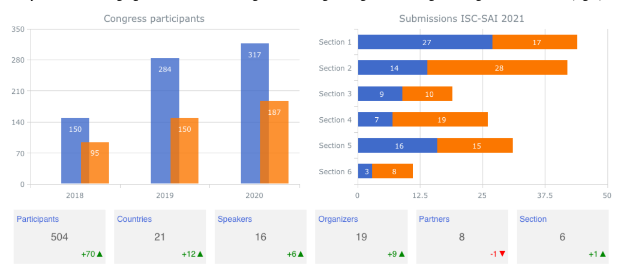
Fig. 3. Indicators Dashboard ISC-SAI 2021.