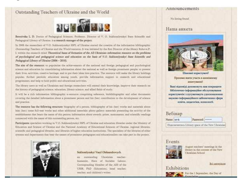
Fig. 3. The homepage of the resource "Outstanding Educators of Ukraine and the world"

It is necessary to note that through the prism of biographies of teachers and educational figures, the development of Ukrainian education, humanistic pedagogical thought in both macro historical and micro historical dimensions is traced. It is noteworthy that the information and bibliographic resource "Outstanding Educators of Ukraine and the World" integrally represents the life path and scientific heritage of a certain famous figure and reflects the degree of its study in the scientific space, helps to make the information requests more profound for a wide range of remote users, including researchers, teachers, students, post-graduate students, doctoral students of Ukraine and the world, in various issues of the history of national and foreign education [29].