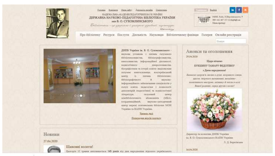
Fig. 2. The homepage of the portal

The homepage (Fig. 2) of the portal corresponds to the key definition of this concept as a general entrance to a specific object. It contains a top navigation block: the website map, online help, contacts, title, menu, slider, information blocks and banners. The information is structured into sections: "About Us", "Resources", "Services", "Activity", "For Scientists", and "For Librarians", each of which reveals a separate topic. "Gallery" introduces individual events, and "Online Registration" allows a remote user to register as a library reader.