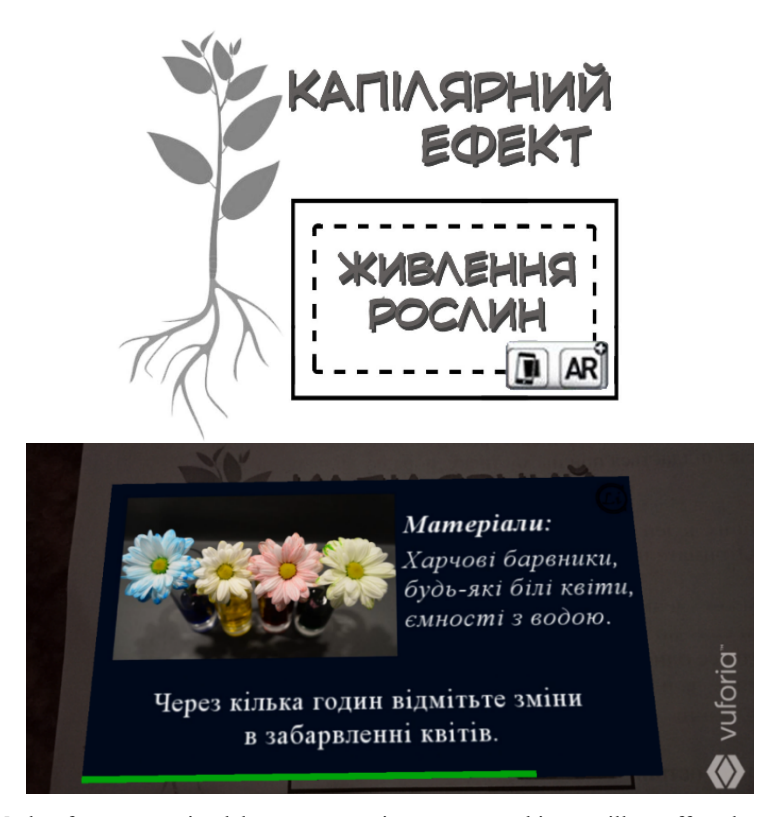
Fig. 2. Marker for representing laboratory experiments, researching capillary effect, located on the lapbook (displayed by AR-technology on the LiCo.STEM application).