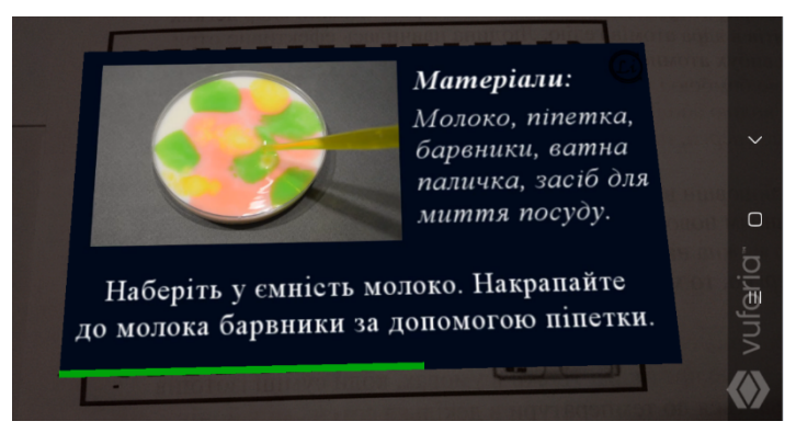
Fig. 3. Marker for representing laboratory experiments, researching surface tension, located on the lapbook (displayed by AR-technology on the LiCo.STEM application).

The video materials developed demonstrate the laboratory experiments, performed by an experienced lab scientist keeping up all the safety regulations. The experiment performance is subtiled with text explanation. Applying the developed video information gives pupil an opportunity (guided by the teacher or parents), to repeat such