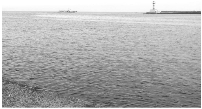
Fig. 3. Odesa region (using geotagging).

Details of shooting: GPS Altitude: 35 m. Latitude N 46 ° 22'12,958 "Longitude E 30° 42'06,821"