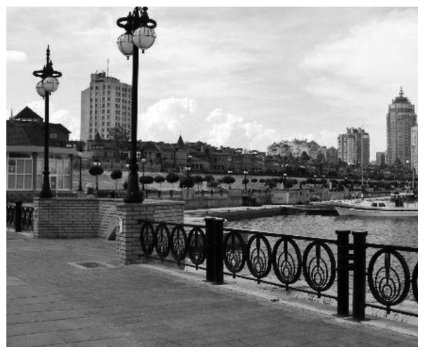
Fig.2. Kyiv, Obolonska embankment" (using geotagging).