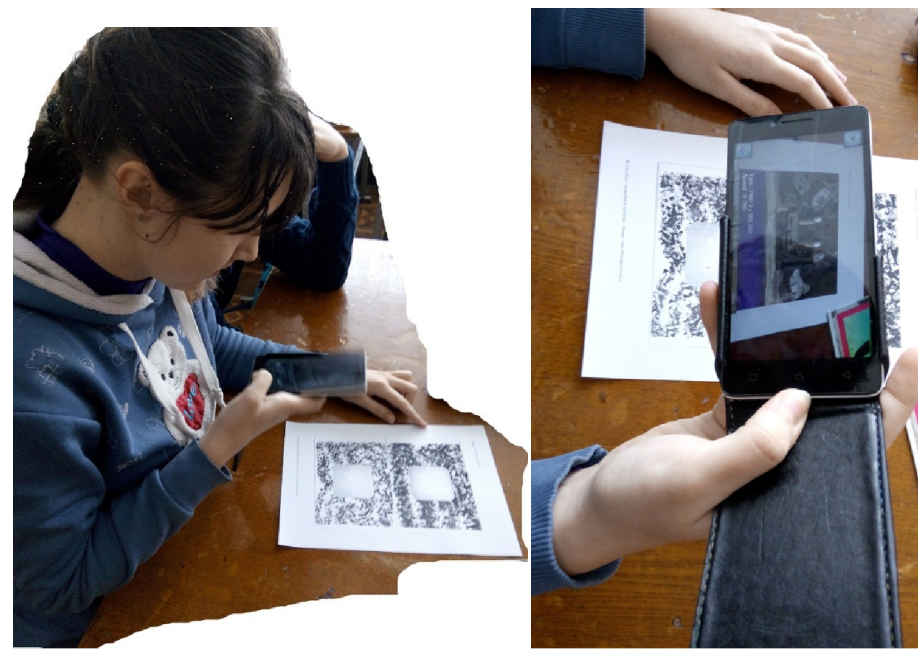
Fig. 5. The work with a marker

During the lesson "Environmental Problems of Nuclear Energy" (Grade 9) it is reasonable to use the elements of the augmented reality [14] (Fig. 5). To do this, before the lesson, the students are encouraged to download the "Augmented Nuclear plants" free application (Fig. 6). The markers printed on paper are distributed to the students.