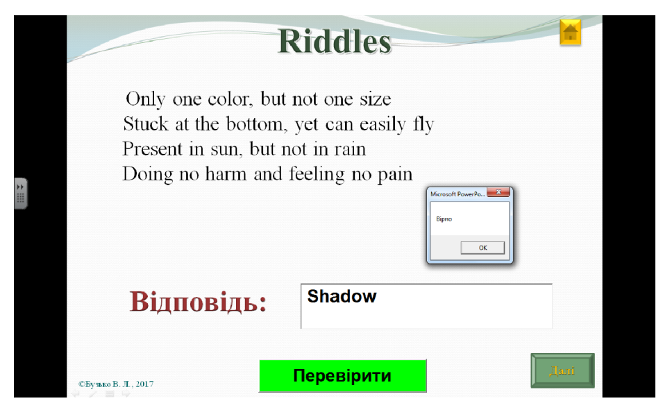
Fig. 4. An example of a riddle