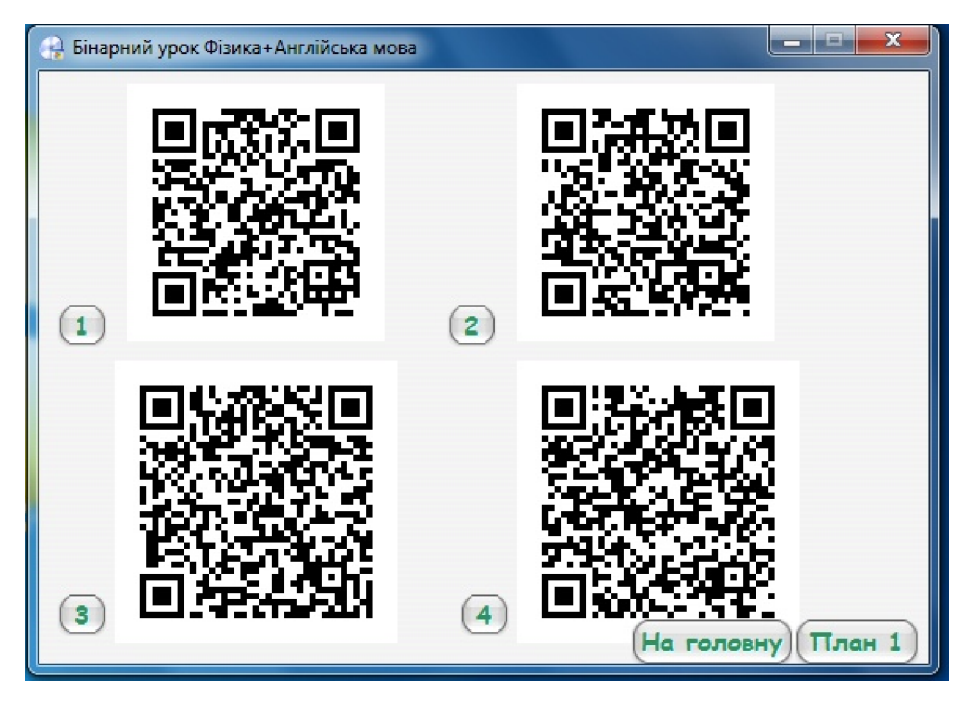
Fig. 2. QR codes for dividing students into teams

in strong salt solution) shrank and became much smaller, and the third, on the contrary, plumped up.